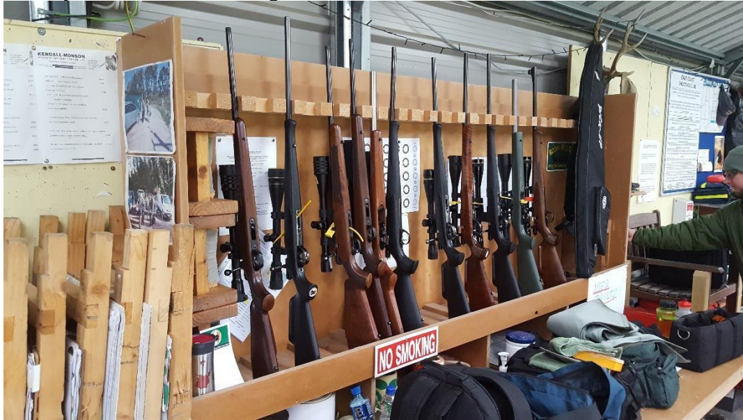
Rifles racked, bolts open and magazines removed during ceasefire

The Range Safety Officer shall remain in attendance at shooting that he is supervising and shall only supervise areas which can be seen and addressed at the same time. Separate individuals must therefore be appointed as Range Safety Officers for areas which cannot be controlled by one person, e.g. the Shotgun and Target Ranges, Gallery Rifle and Pistol range.