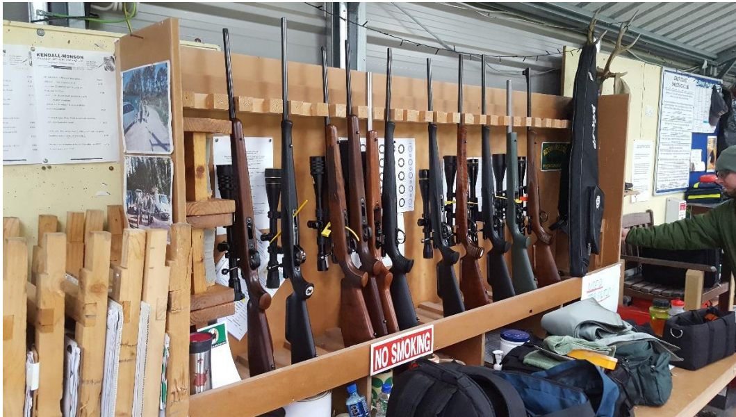
Rifles racked bolts open and magazines removed during ceasefire

The Range Safety Officer shall remain in attendance at shooting he is supervising and shall only supervise areas which can be seen and addressed at the same time. Separate individuals must therefore be appointed as Range Safety Officers for areas which cannot be controlled by one person, e.g. the Shotgun and Target Ranges, Gallery Rifle and pistol range.